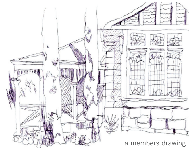
a members drawing